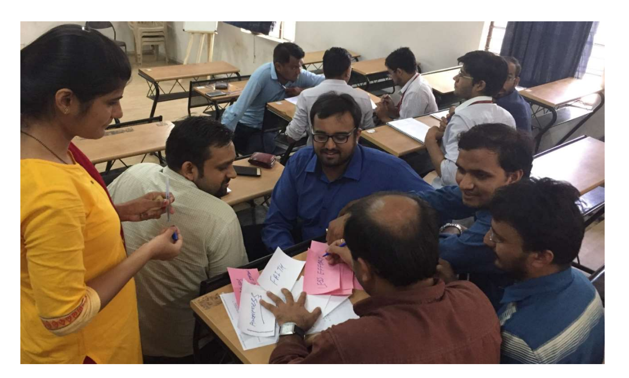
Participants Activities on metaplan