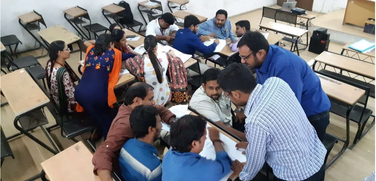
Participants Activities on Collaborative learning