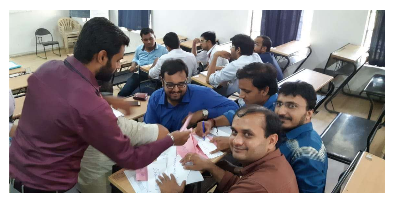
Participants Activities on metaplan