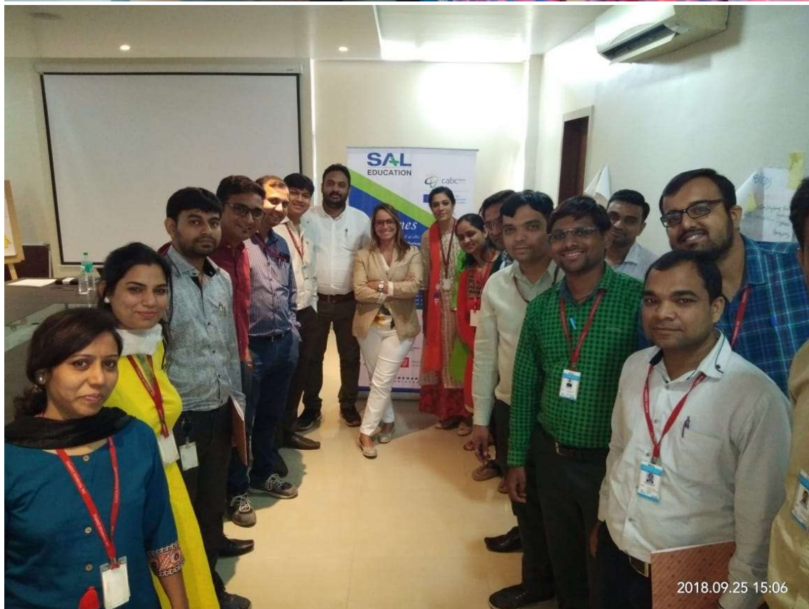
GROUP 2 Participants with mentor