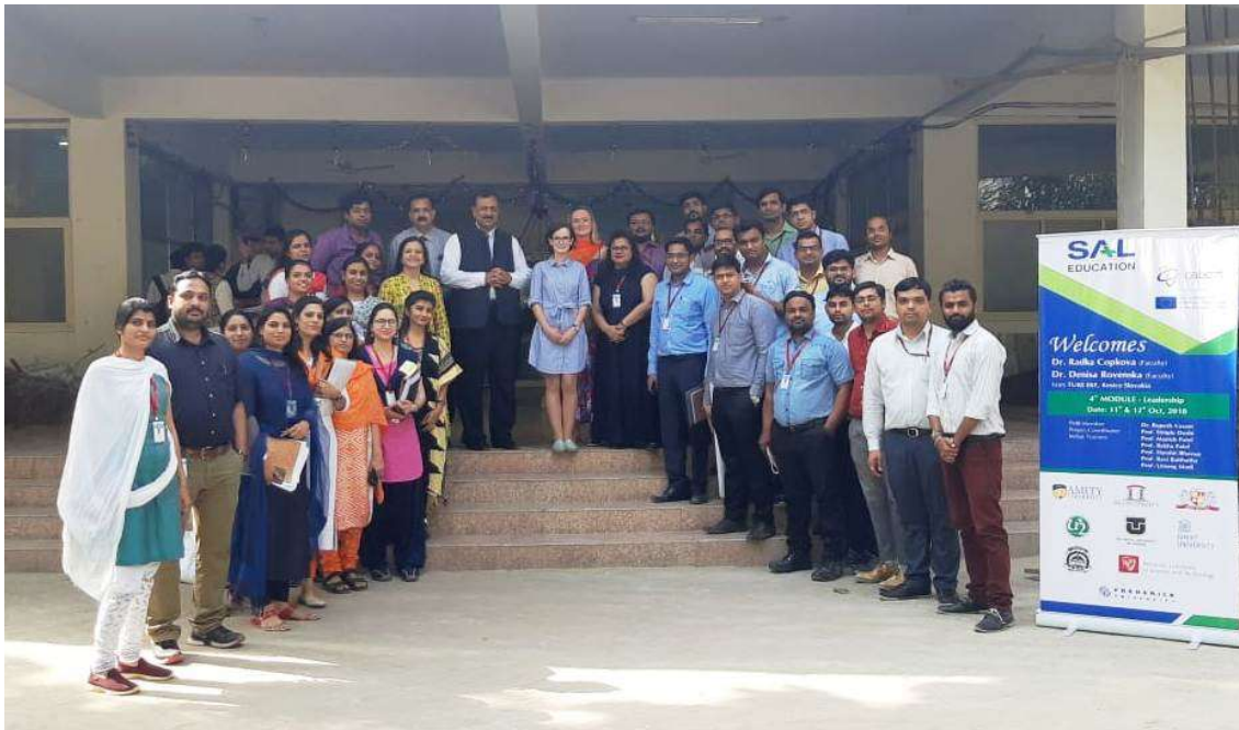
Participants with Mentor and SAL Management