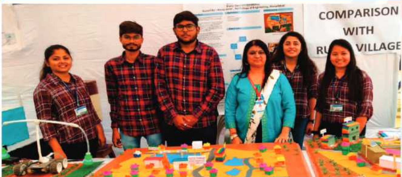
Project Display at Technical Festival