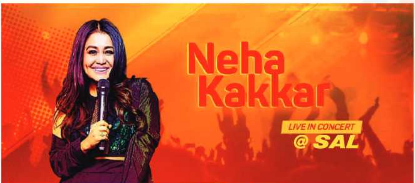
Live Concert by Miss Neha Kakkar