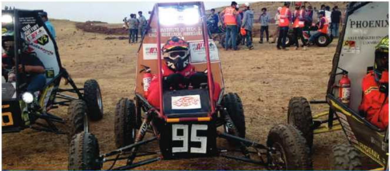
Winner of Mega ATV Championship