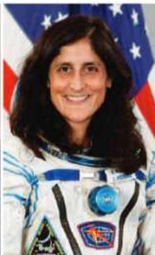
Ms. Sunita Williams