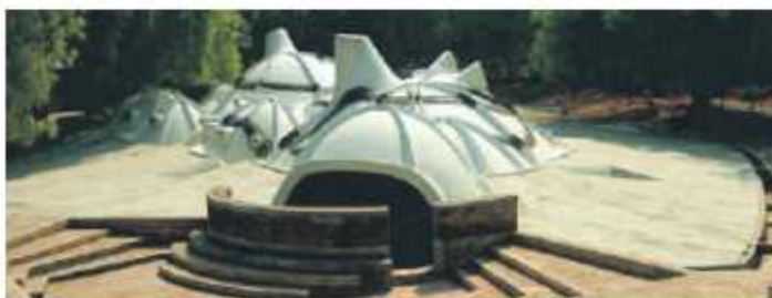
Art And Culture

The Campus location in the busy developed area and in its educational district, provides easy access to theatres, restaurants, museums, and much more. The city is youthful and cosmopolitan, with plenty to see and do.