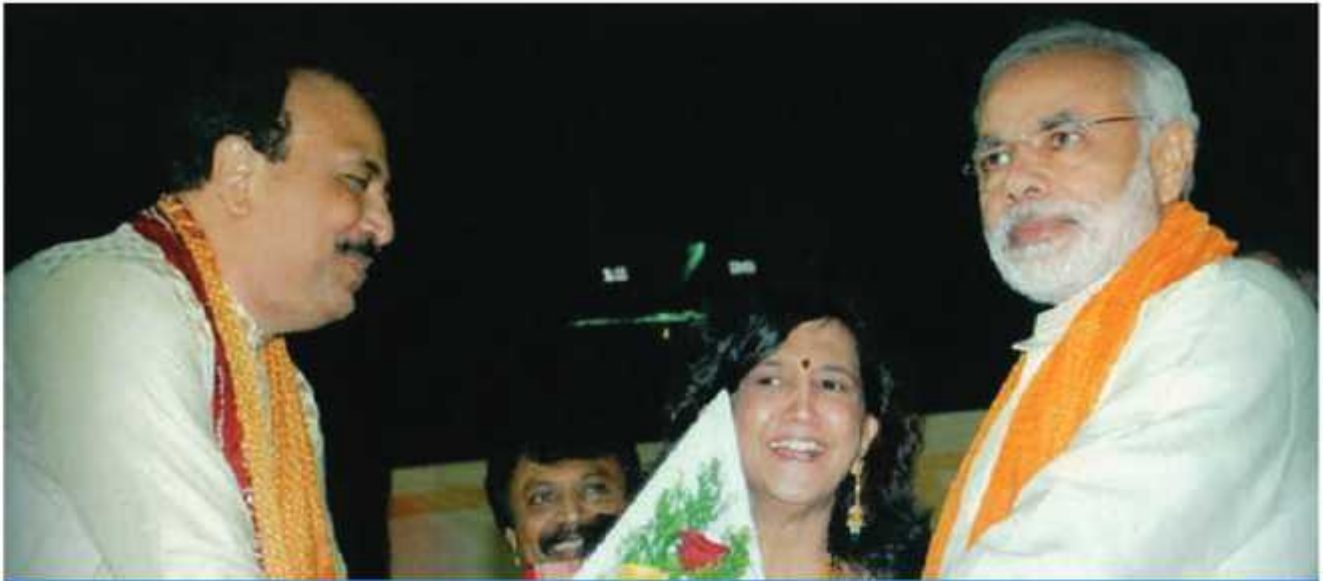
Hon'ble PM Shri Narendra Modi at Navaratri Festival