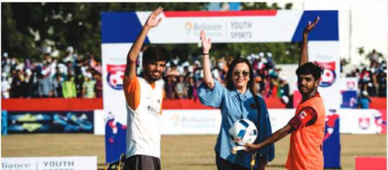
Reliance Foundation Youth Sport Football Championship Inaugurated by Mrs. Nita Ambani