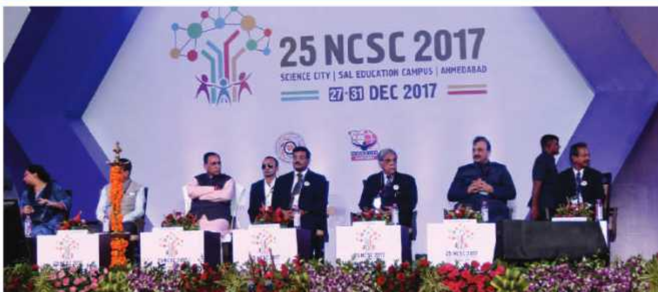
25 th National Children's Science Congress